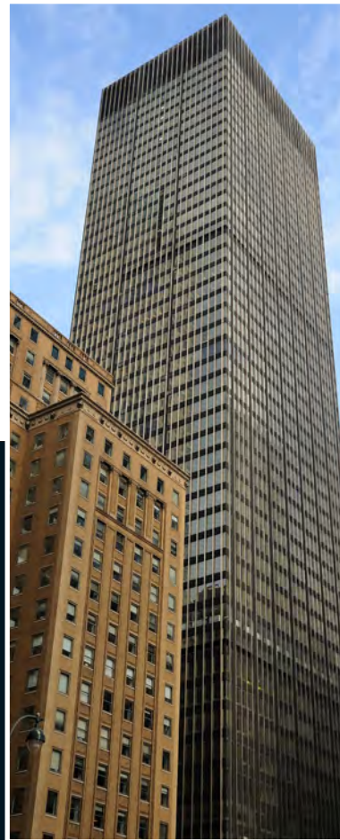
JP MORGAN CHASE - NEW YORK, NEW YORK, USA 164 CEILING HUNG ELITE STAINLESS STEEL TOILET PARTITIONS

Less expensive than composite and phenolic type toilet partitions, stainless steel is a very cost effective option. Stainless steel achieves an upscale look and outstanding performance at an affordable price point.